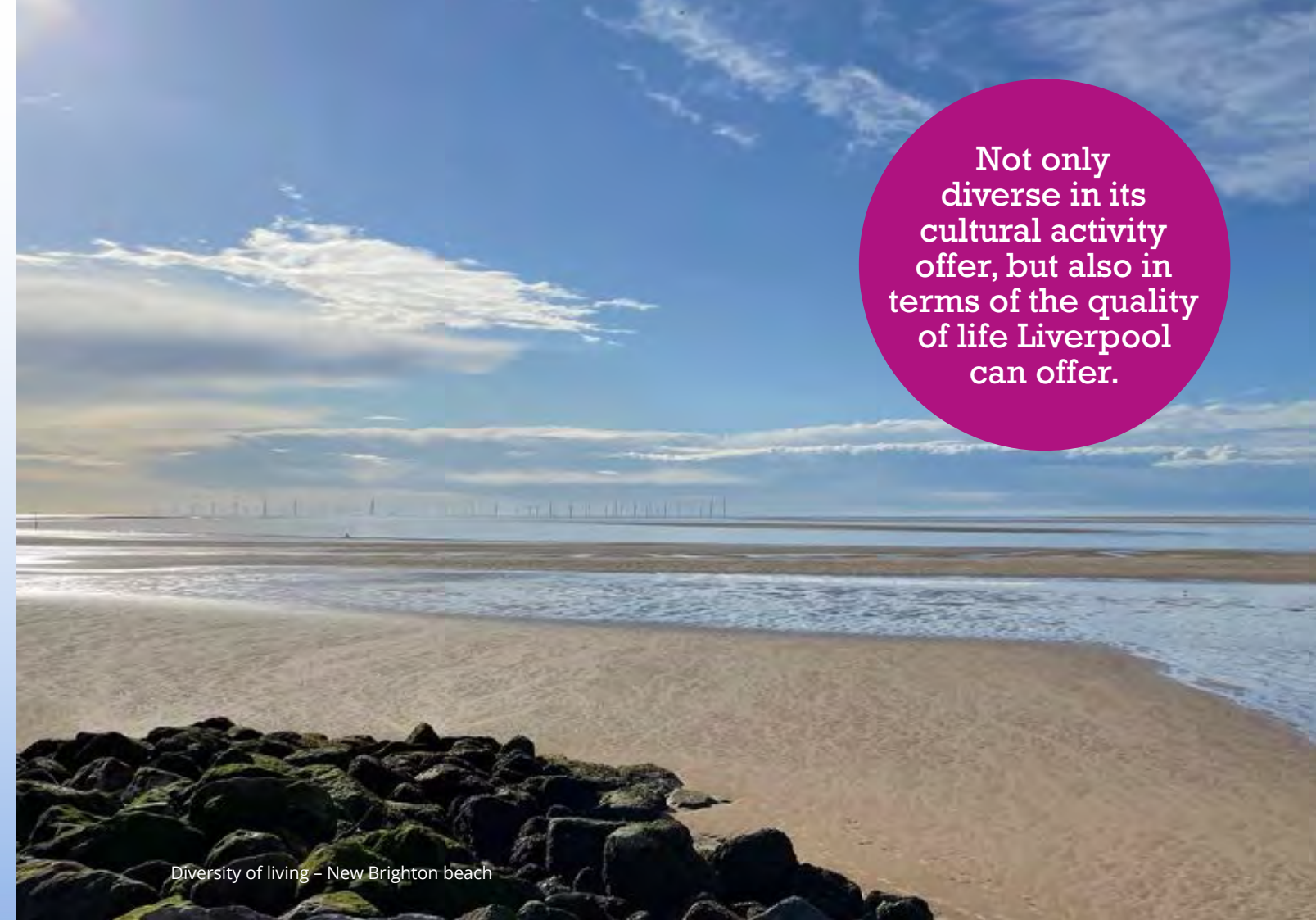
Diversity of living – New Brighton beach

Not only diverse in its cultural activity offer, but also in terms of the quality of life Liverpool can offer.