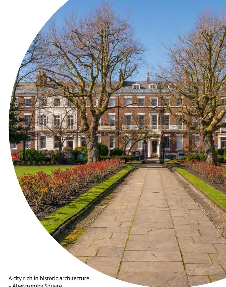
A city rich in historic architecture – Abercromby Square

Often referred to as the "best place to visit" or "the best city to go out in," Liverpool's visitor economy was booming pre-pandemic and the pull of this Northern city was attracting ever increasing student applications (Groupia 2021). Whilst hard to quantify why the culture of the people of Liverpool stands it apart from other UK cities, it certainly seems to have a greater emotional resilience than most, a will to do it first, to experiment and a desire to take risks.