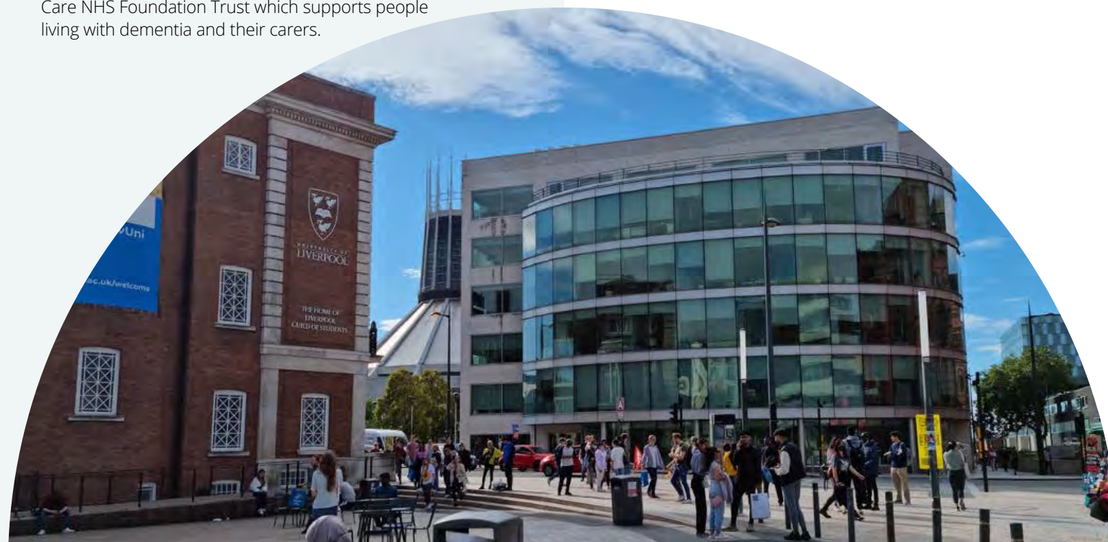
Students return to the University of Liverpool in KQ Liverpool Image of Abercromby Square: Ben Blackall

The city's participation in the events research programme, with Culture Liverpool playing a core role, is an example of Liverpool using its cultural position, and the appetite of its local population to participate in unique events, to not only support the economic sector in trialling the opening up of the night time economy, but also to support public health research and policy. Looking ahead, there are ongoing talks for net zero carbon gigs to be hosted in the city. As with the event's pilots, this would be another Liverpool world-first. We should continue to seek opportunities which utilise Liverpool's cultural strengths in order to generate environmental, health and social impacts. For the latter mentioned, there is more to be made of Liverpool's cultural offer in inspiring the next generation of creatives in local communities. The KQ Liverpool outreach programme will support this effort in also highlighting the creative opportunities available in the city and region to young people to inspire and spark ambition.