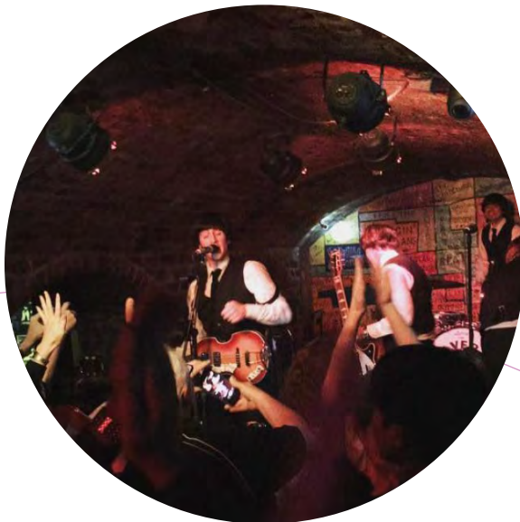
A Beatles tribute band at the Cavern Club 60 years on

Another Liverpool first, the School of Sport and Exercise Science was the first institution in the world to host a single honours degree programme in sport science back in 1975 (Liverpool John Moores University 2021). Liverpool's global music and sporting reputation has evidently impacted the city's ability to attract the brightest talent and academics in these particular fields.