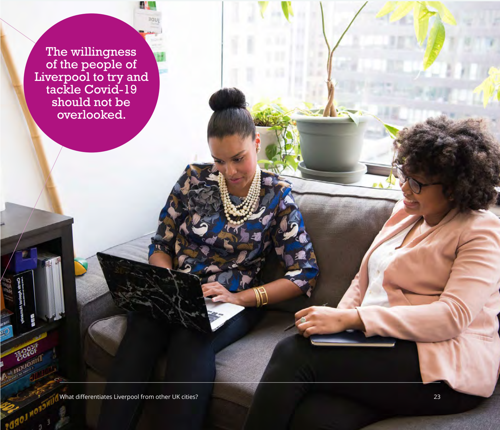
What differentiates Liverpool from other UK cities?

The willingness of the people of Liverpool to try and tackle Covid-19 should not be overlooked.