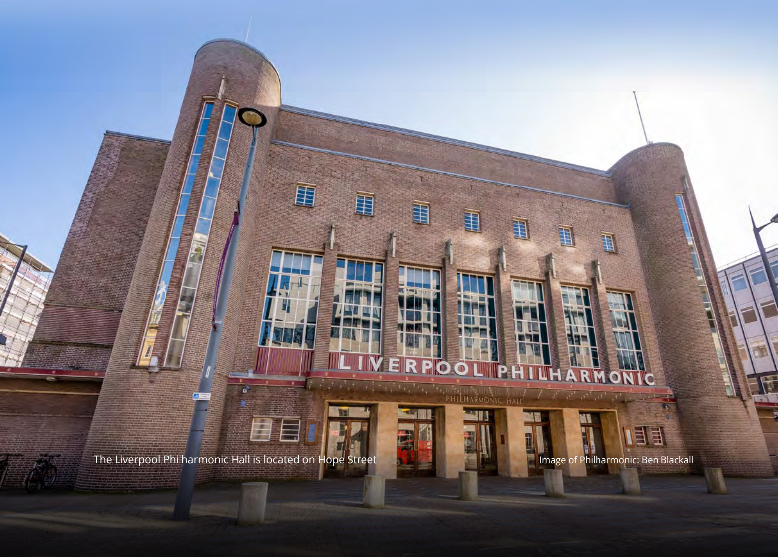
The Liverpool Philharmonic Hall is located on Hope Street