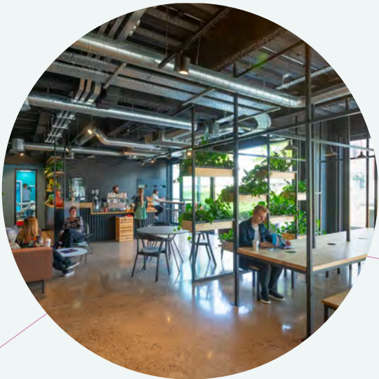
Transformed by Sciontec - Liverpool Science Park

Home to the first commercial wet dock, Liverpool was referred to as the “second city of the Empire” until its post-war decline eventually led to the closure of Albert Dock in 1972 (BBC 2015). The River Mersey is however now once again a point of differentiation when compared to other UK cities with Liverpool home to the largest transatlantic dock facility, Liverpool2 (BBC 2020).