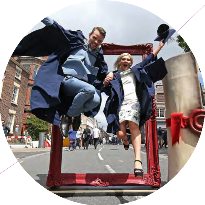
Image of Graduates: LJMU

There is certainly scope to improve the region’s graduate retention figures with schemes such as LCR Grad 4 , LJMU Graduate Futures 5 , and KQ Grad 6 seeking to tackle this issue. In addition to other factors such as the quality of life offering, this largely relies on the opportunities being there in the first place. Consistent feedback from students demonstrates their desire to stay in the region after graduating, but they are forced to leave due to being unable to find sufficient graduate level jobs (Liverpool City Region Combined Authority 2020, 10). This also goes for students in local Further Education colleges too, with one example being the City of Liverpool’s Digital Academy which is training the next generation of leaders in the digital sector, but talent is being lost to other cities due to the lack of current opportunities in the region. In this way, attracting talent and investment is a cyclical process, both largely dependent on each other. A healthy talent pipeline is attractive to investors and high quality jobs are attractive to talent. Stronger differentiation will only be additive in our efforts to attract both to Liverpool.